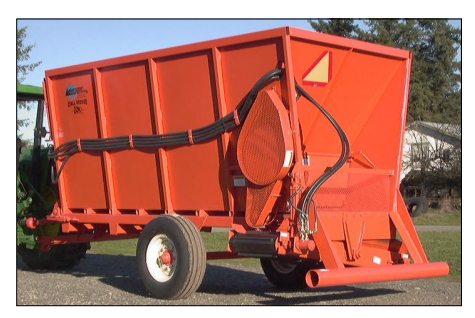
Rear Discharge Stall Bedder

If your application requires a custom built machine, call or Email us with your details and we can provide a quote. Custom machines are not a problem!