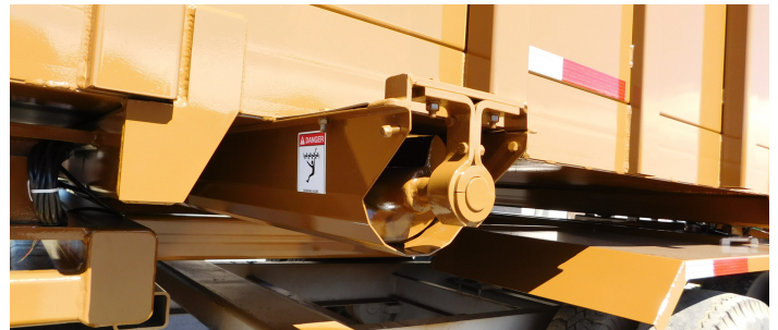
GRAIN SEALER AUGER

THE KIRBY LARGE CAPACITY DELIVERY BOX IS ALL ABOUT ONE THING: HELPING YOU GET MORE DONE IN LESS TIME! With an extra wide door, speedy conveyors and a maximum capacity of up to 1600 cu.ft, the Large Capacity Delivery Box keeps you feeding longer by reducing the number of trips needed to feed out your herd. Isn't it time you got some more time back in your day?