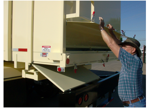
CLEAN OUT DOORS