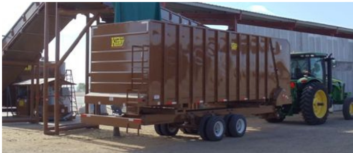
TRAILER MOUNTED BOX