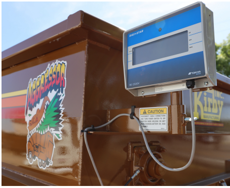
DIGI-STAR SCALE SYSTEM