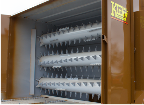
BALE BEATER CABINET